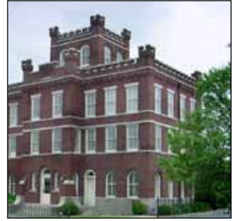
Moultrie Chamber of Commerce