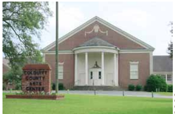
The restored Arts Center building is home to contemporary pursuits in the arts.

There is a history of achievement in Moultrie, Georgia. An infant meatpacking industry that many didn't anticipate would succeed became a mainstay so integral to the community, "Packers" remains as the high school football mascot moniker. Indeed, the can-do spirit of 1914 entrepreneurs remains on the field, in all aspects of Moultrie's community and commercial life.