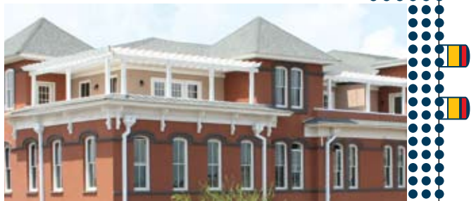
The Mitchell house has a second life as city lofts and condominiums.

Today, the rich and famous, along with those on a budget, continue to travel to this beautiful Southern city and everyone finds that Thomasville is worth the trip.